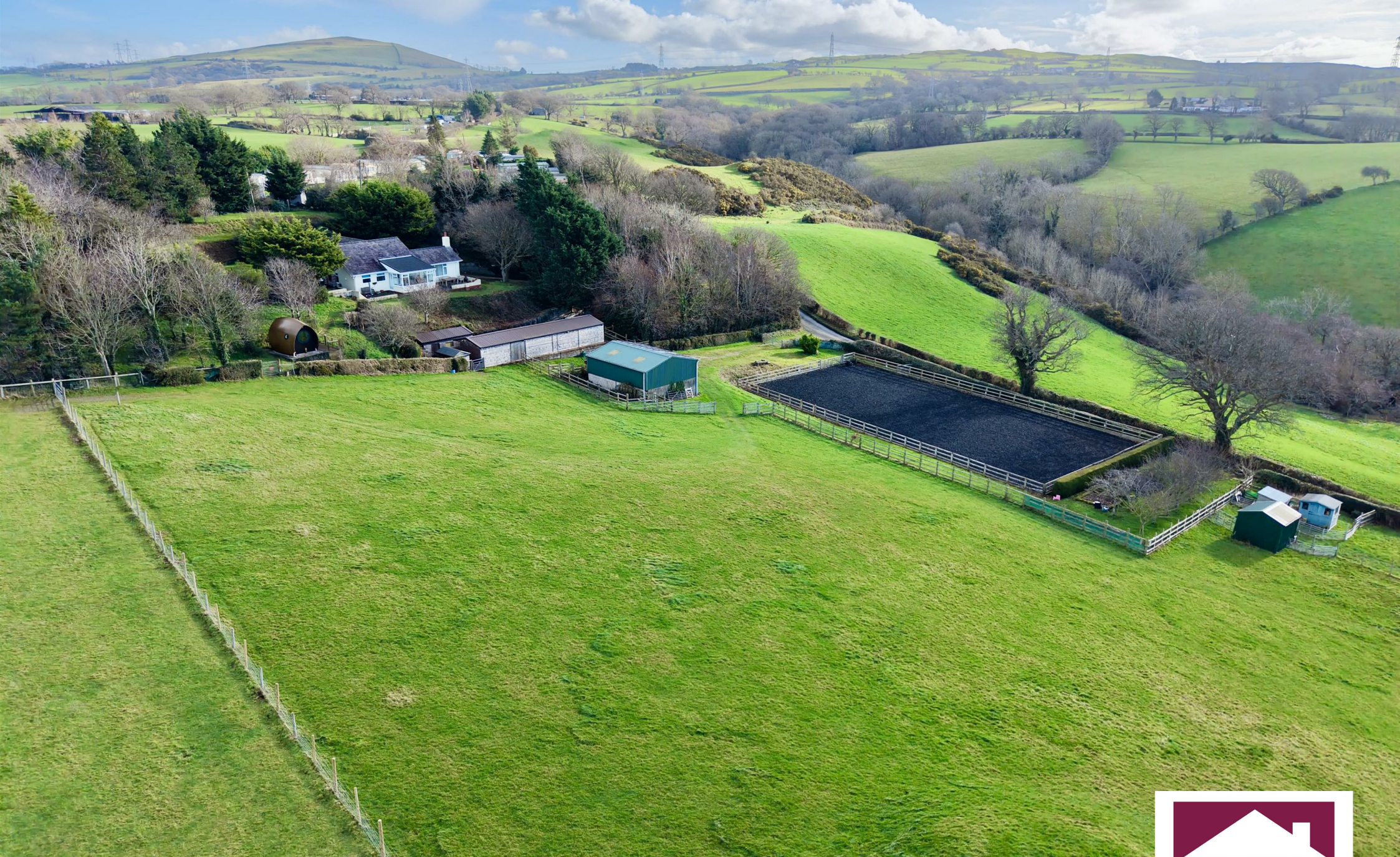
Tan Y Bryn, Roadside Nr Abergele LL22 8PL