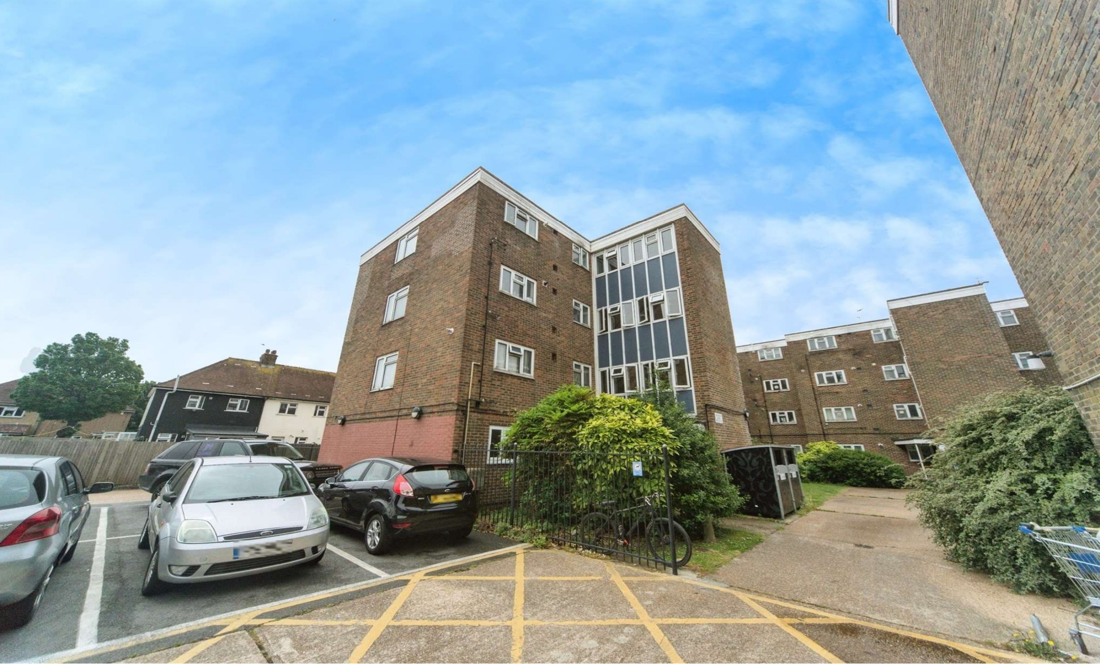
Renfrew Court Allfrey Road, Eastbourne BN22 7SZ