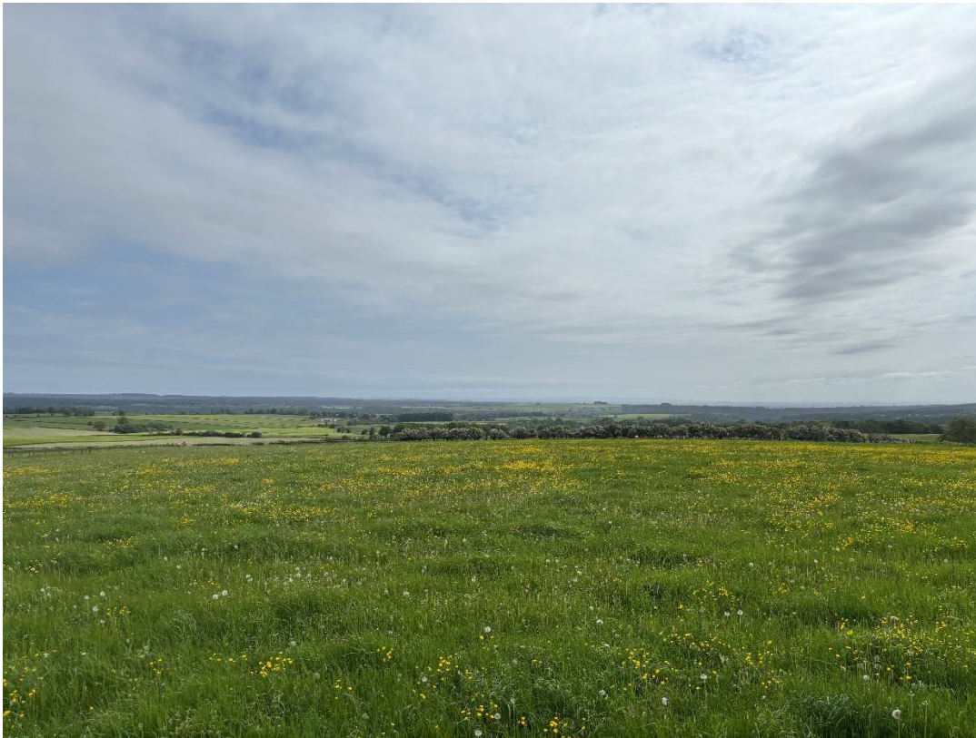
LOT 1 : 8.87 ACRES