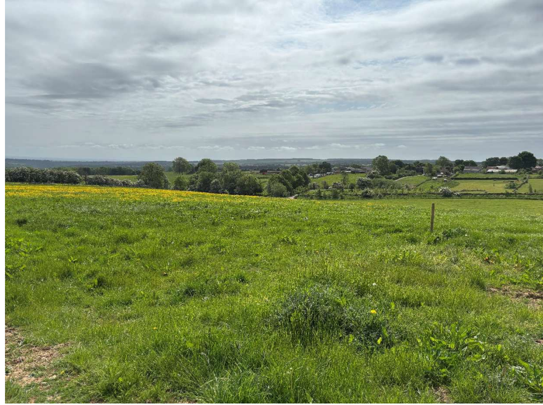
LOT 2 : 7.53 ACRES