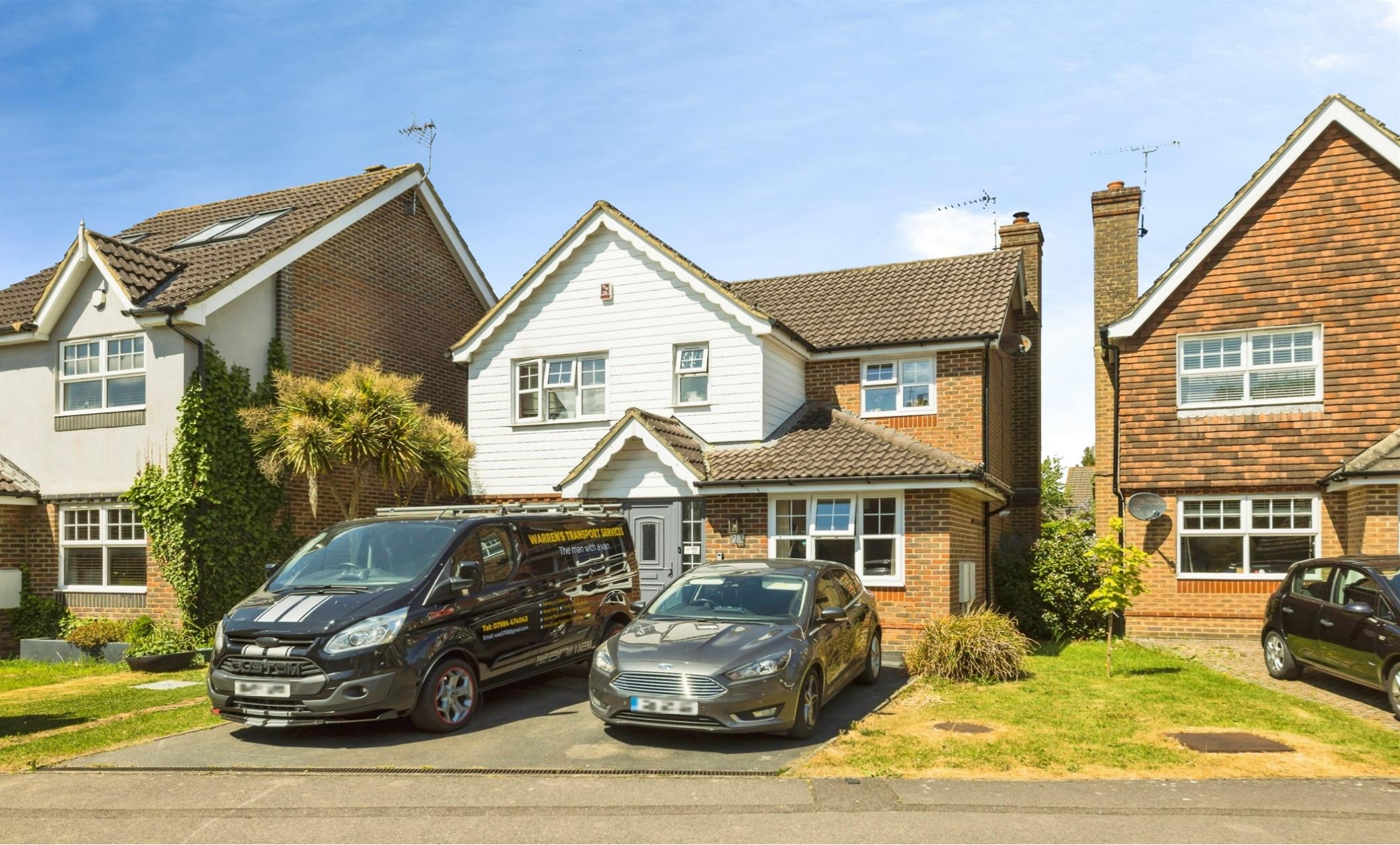
The Oaks, Burgess Hill RH15 9XP