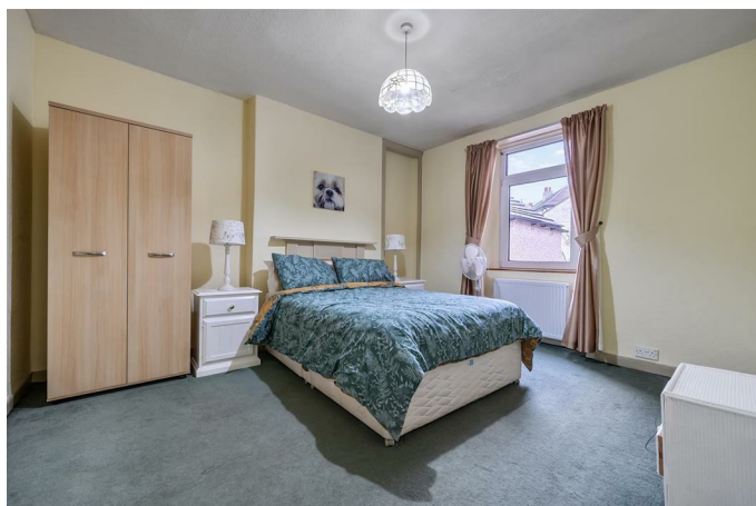
Double in size. Rear aspect double glazed window, radiator.