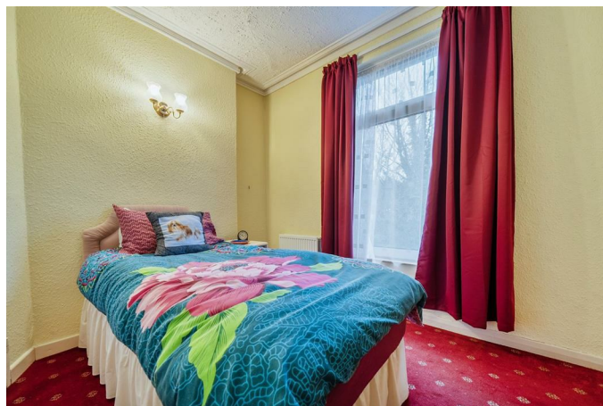
Single in size. Side aspect double glazed window, radiator, with door leading to internal corridor with side aspect double glazed window and radiator. Door leading to: