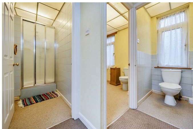
Shower room with single walk-in shower.