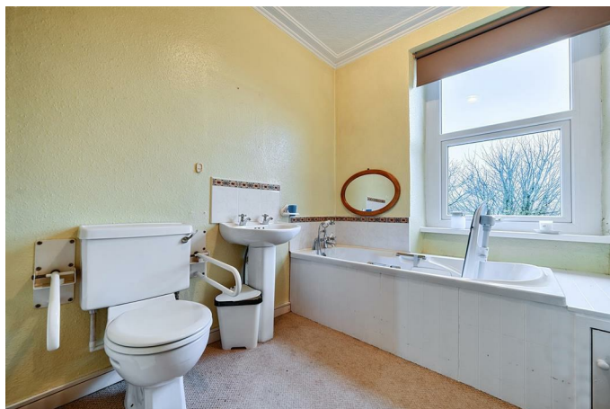
Three-piece suite comprising of bath, WC and wash basin. Front aspect, double glazed window, white wall tiling.