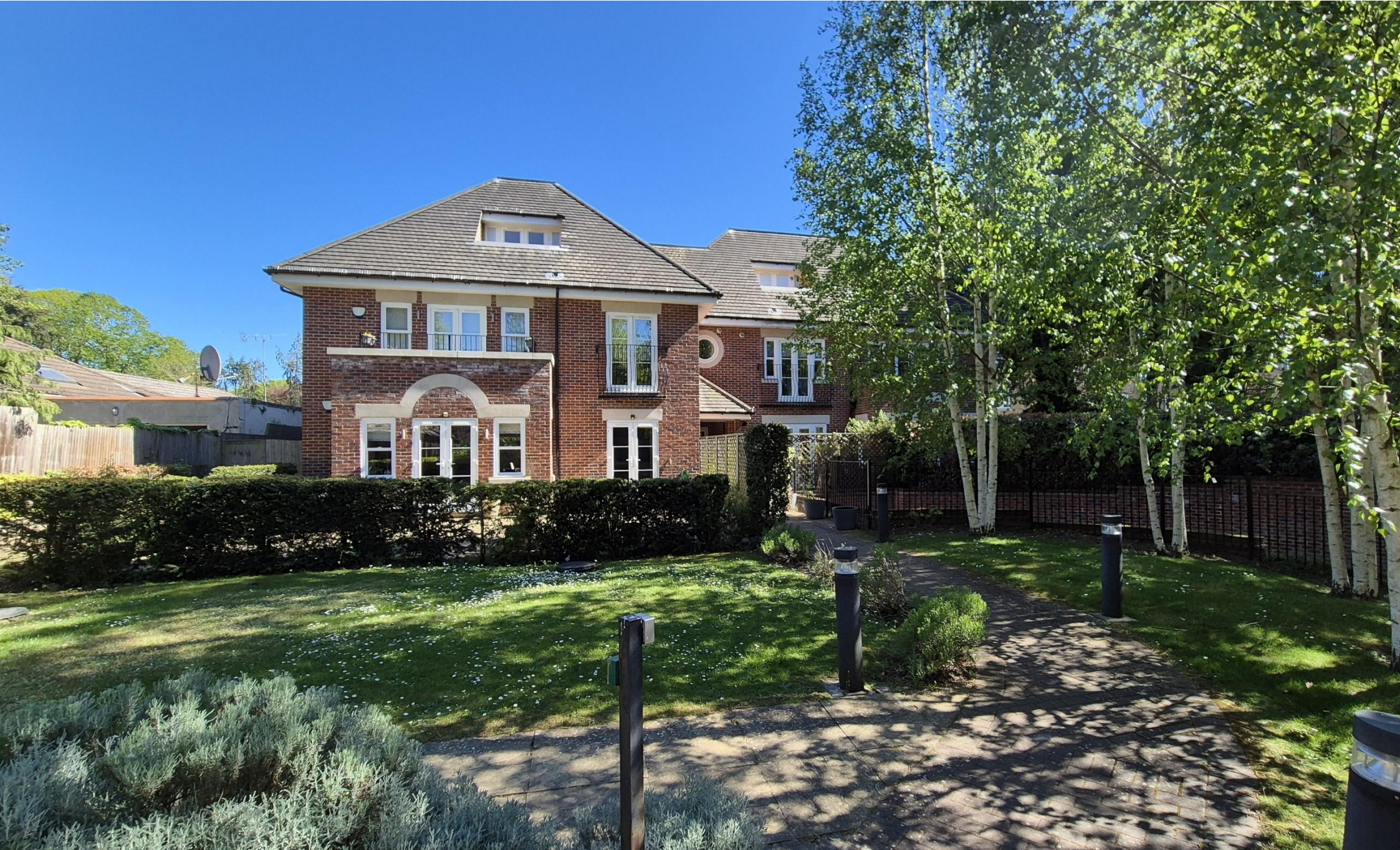
Roseanna Lodge, Village Road, Enfield, EN1 2ET