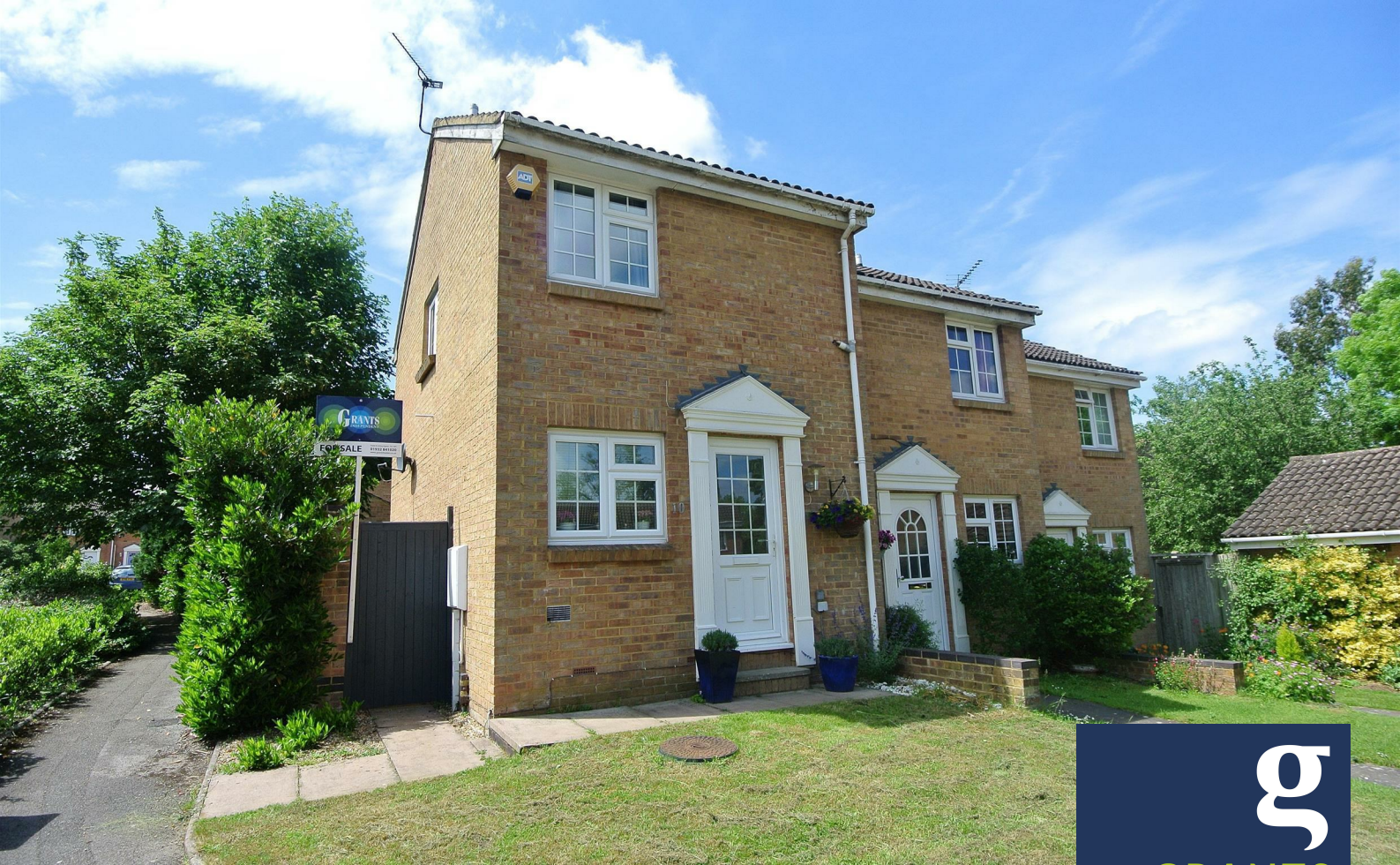
Finnart Close, Weybridge, KT13 8QE