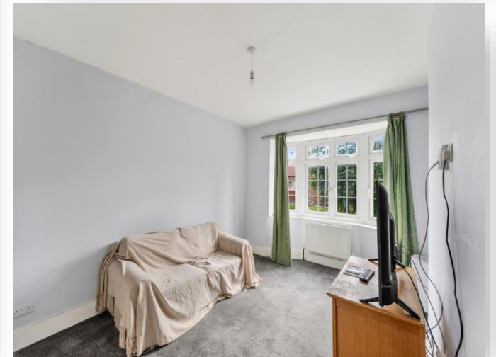
Godley Road, London SW18 3HA