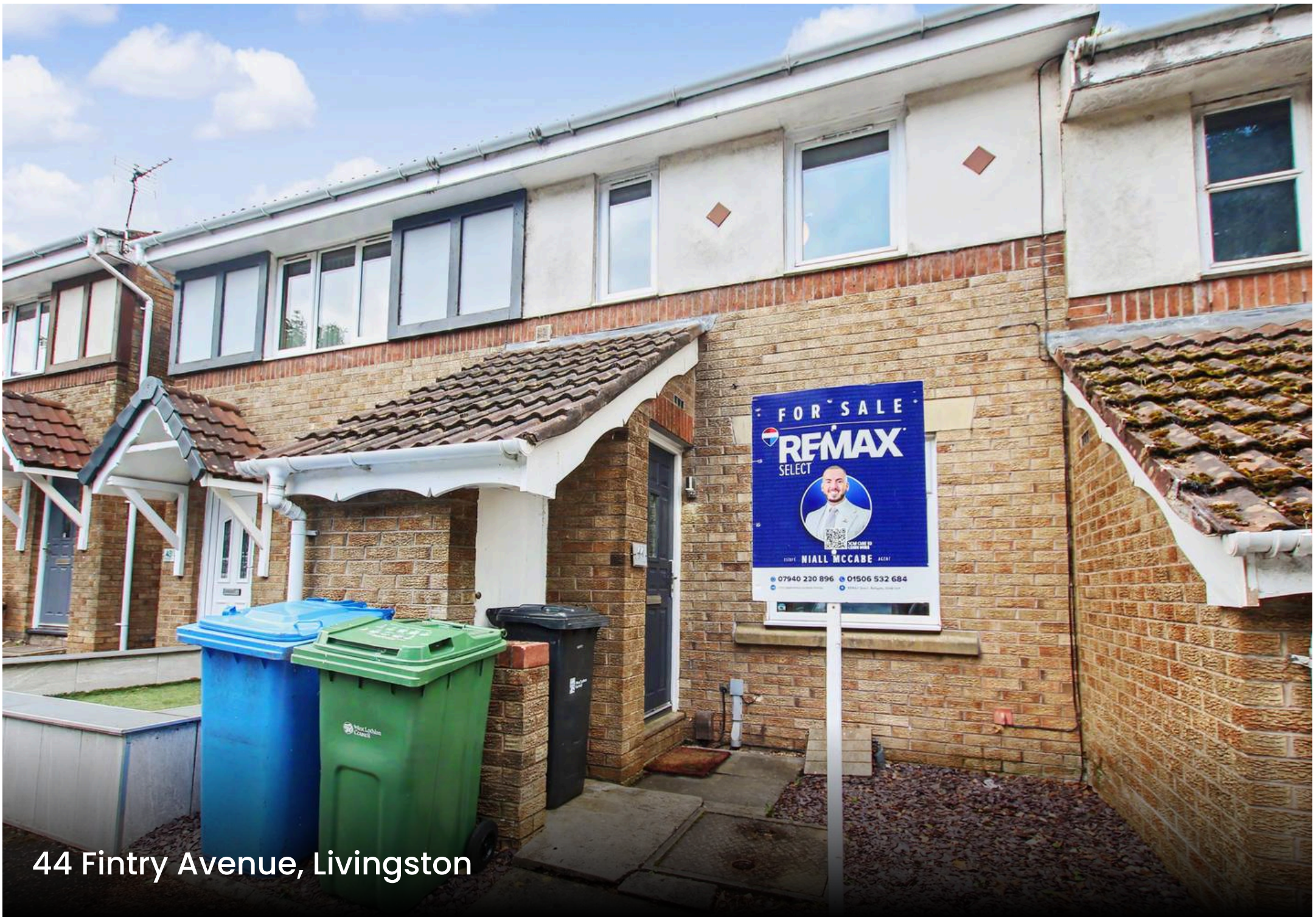
44 Fintry Avenue, Livingston