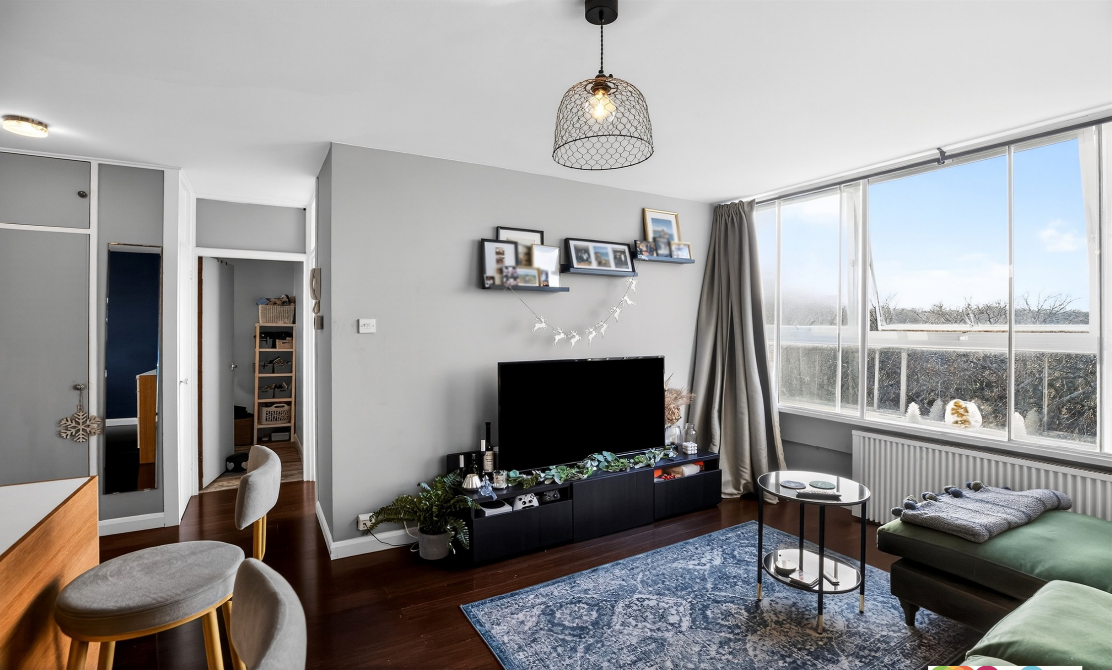
Hedley Court Putney Hill, London SW15 3NS