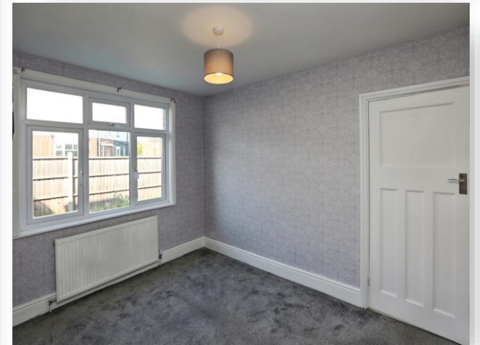
Grange Crescent, Gosport, PO12 3DS