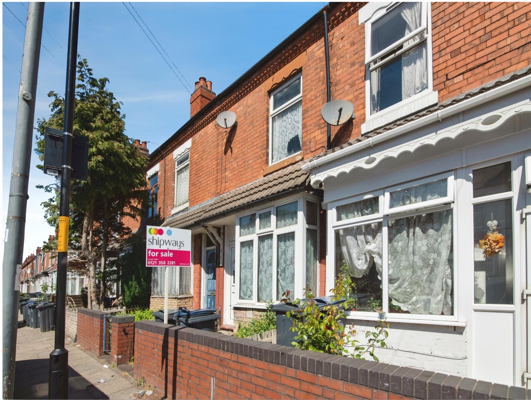
Brantley Road, Birmingham B6 7DR