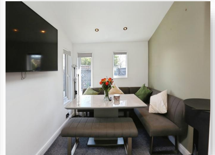
Coral Court, Gosport PO13 8EA