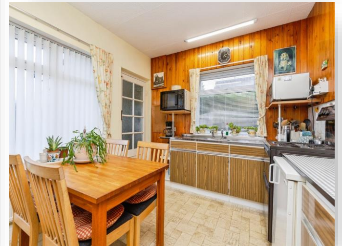
Egerton Road, Hartlepool TS26 0BL