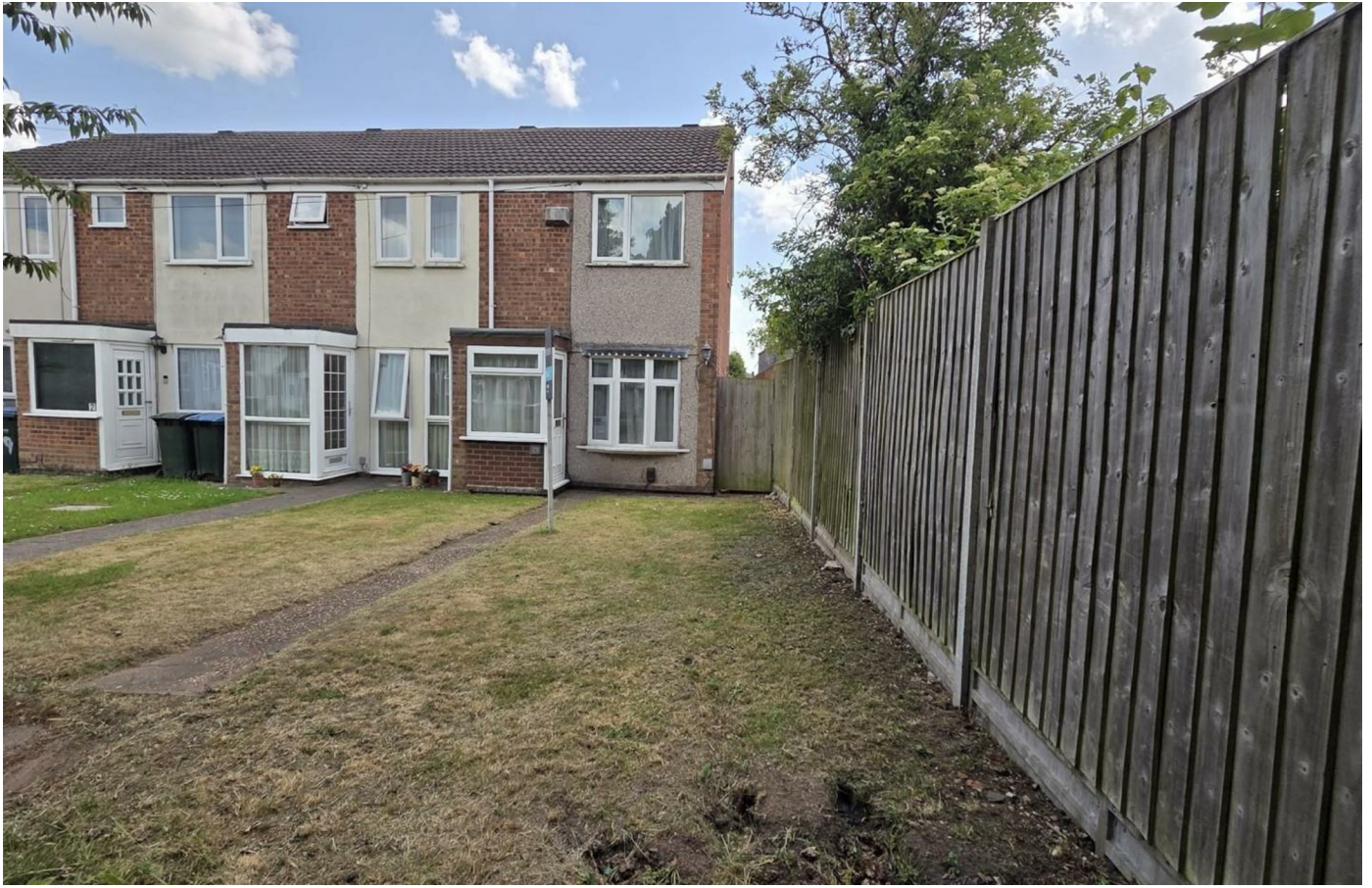
Repton Drive, Coventry