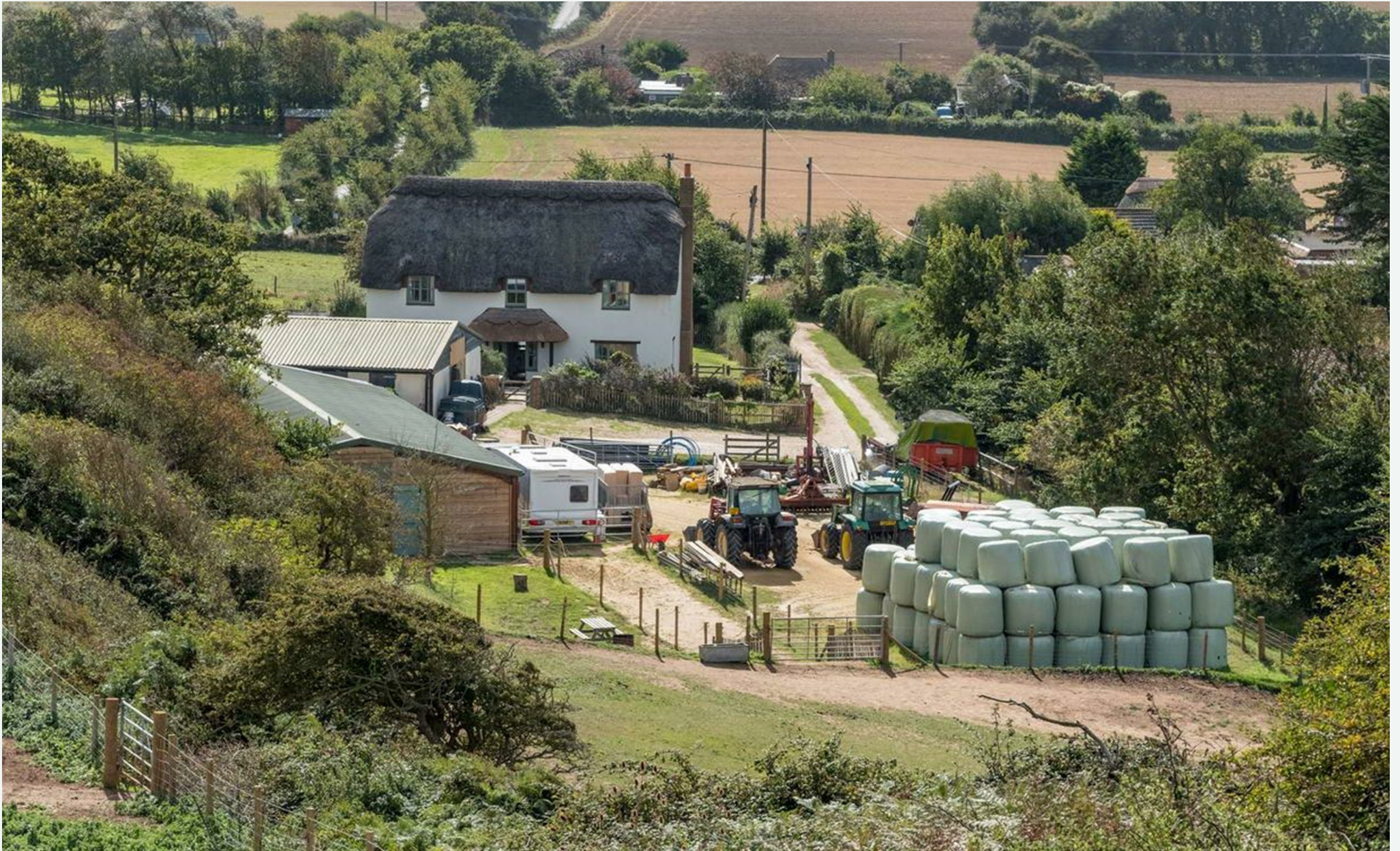
Bremells Farm Limerstone Road, Limerstone, Brighstone, Isle Of Wight, PO30 4AB