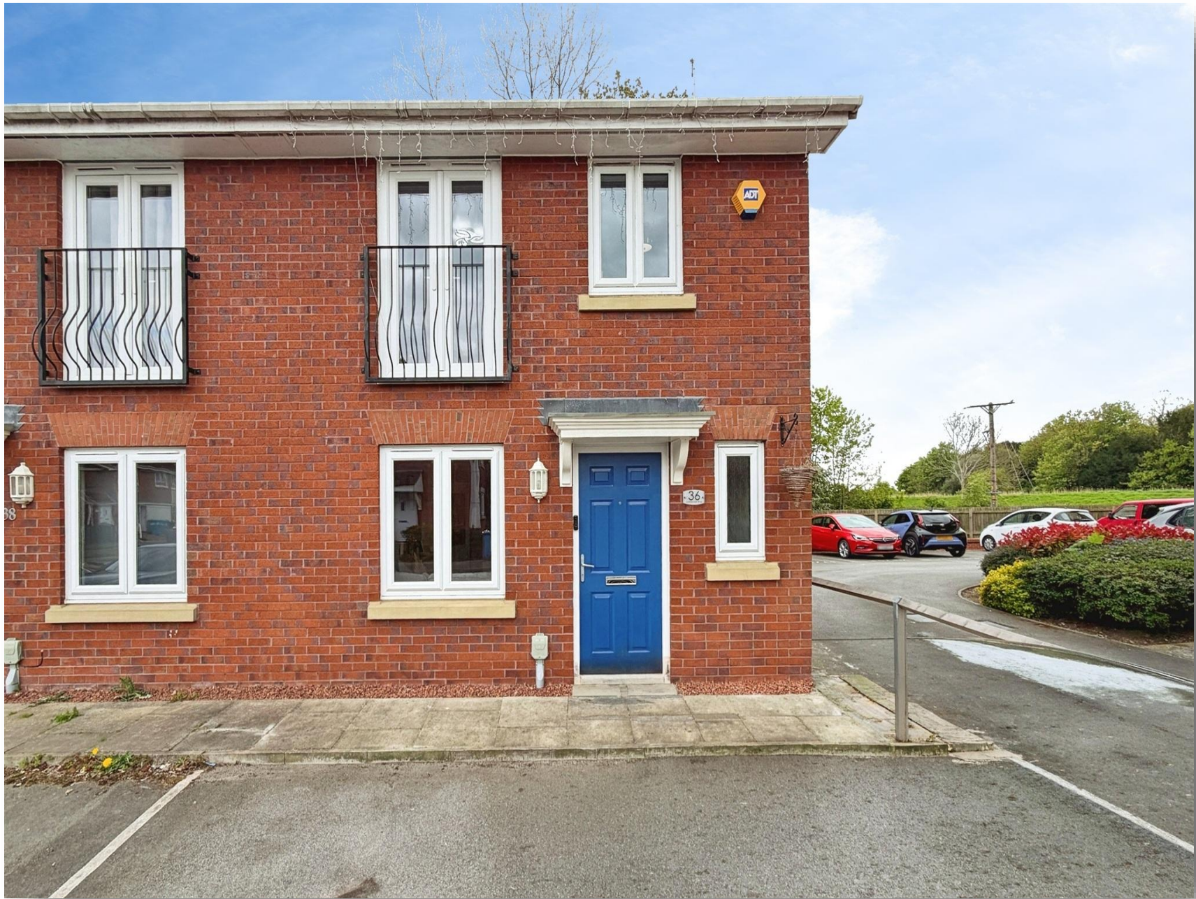
Ladybower Way, Kingswood, Hull, HU7 3BQ