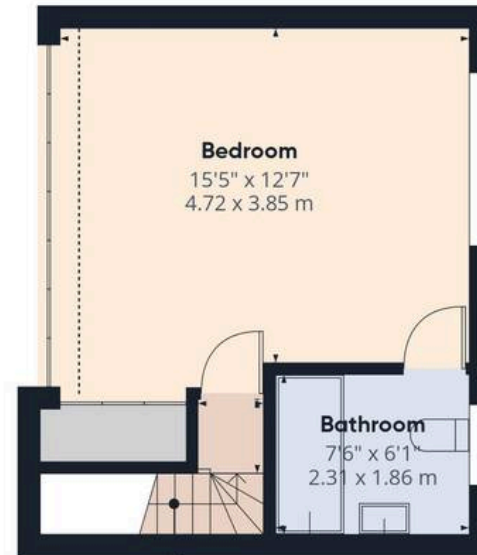
Landing 2'6" x 2'8" 0.76 x 0.82 m