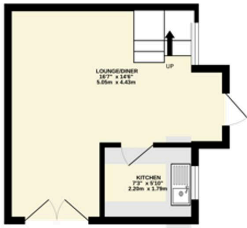
GROUND FLOOR 225 sq ft. (21.7 sq m.) approx.