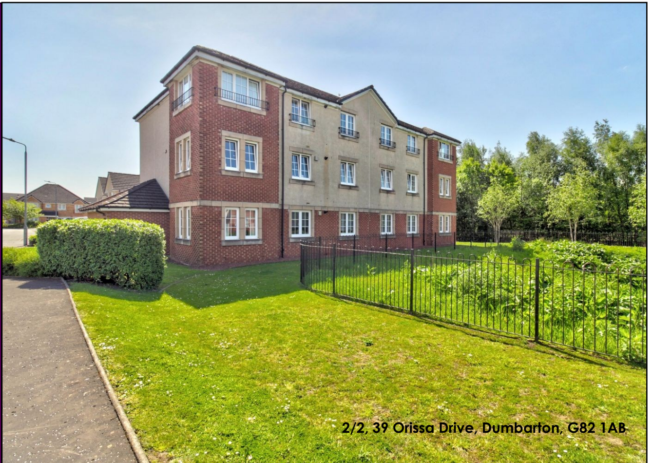
2/2, 39 Orissa Drive, Dumbarton, G82 1AB

This beautifully presented three-bedroom top-floor apartment is offered to the market by David Muir Estates and is set within the highly sought-after Appleton Estate, conveniently positioned within walking distance of local shops, schools and excellent public transport links.