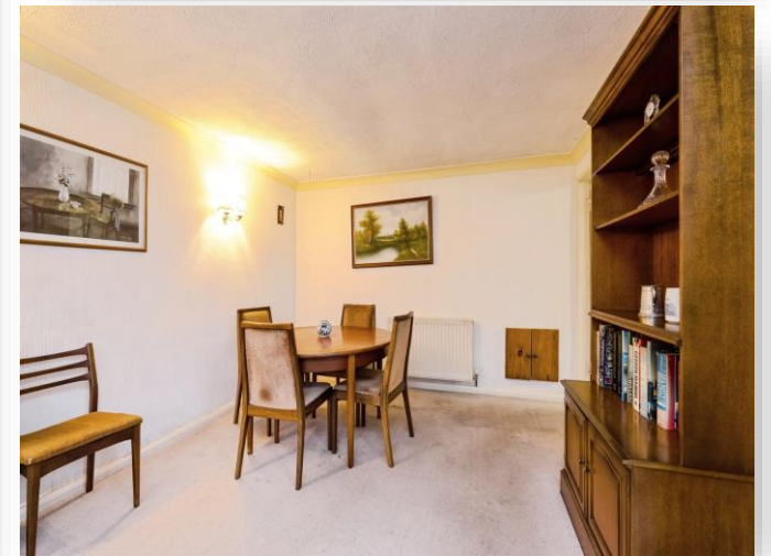
St. Marys Road, Stilton Peterborough PE7 3RX