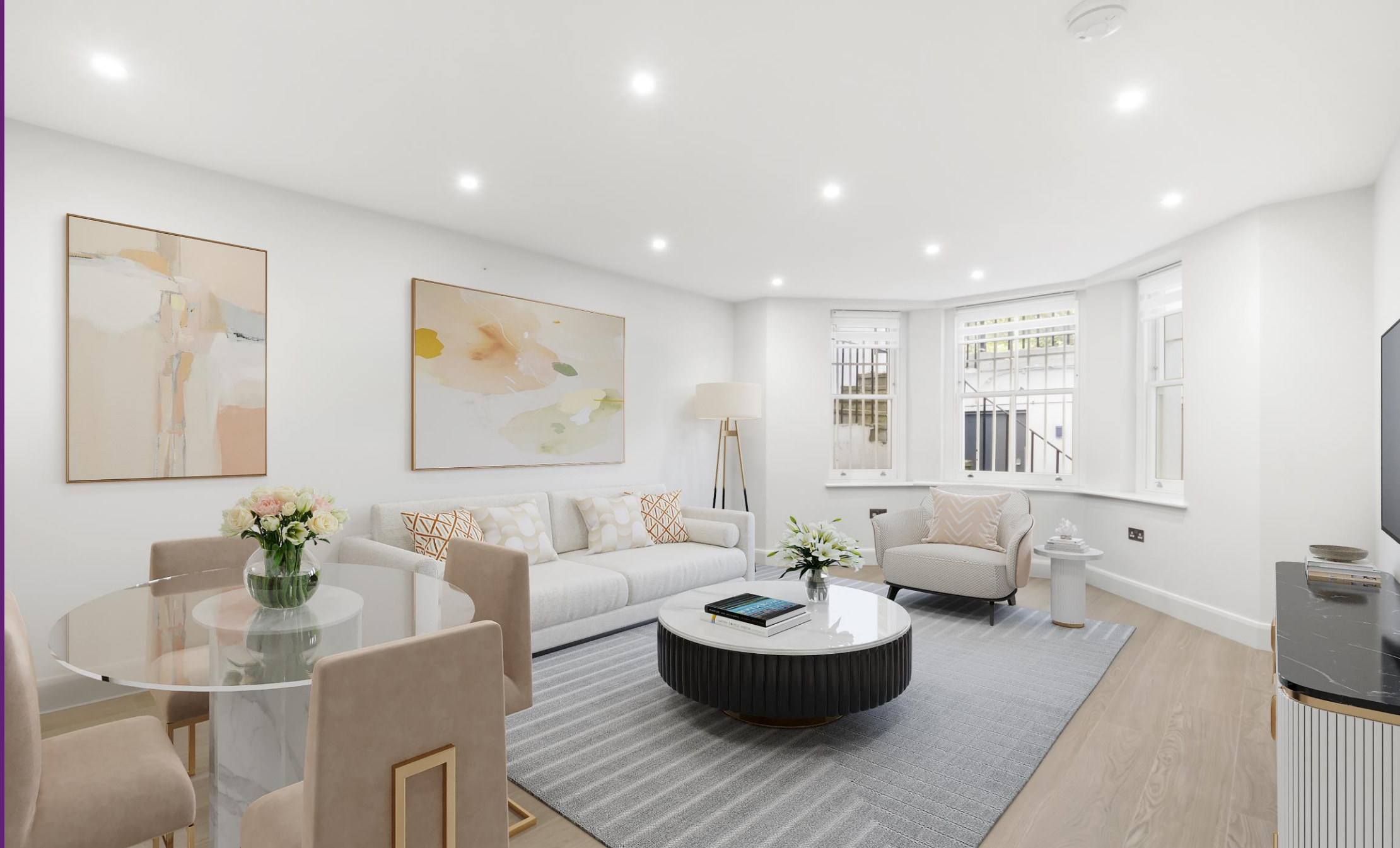
Courtfield Gardens South Kensington, SW5