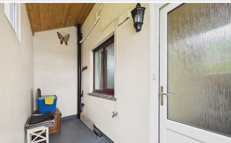
Rear Entrance Porch