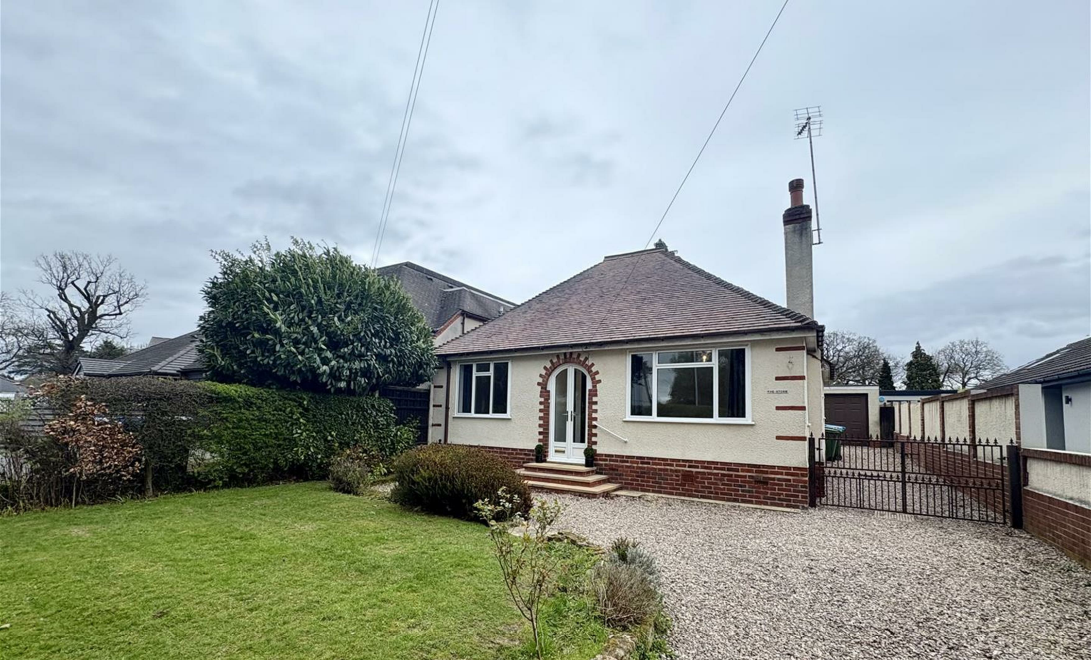
The Stork, Hawthorne Lane, Codsall, Wolverhampton, WV8 2DA