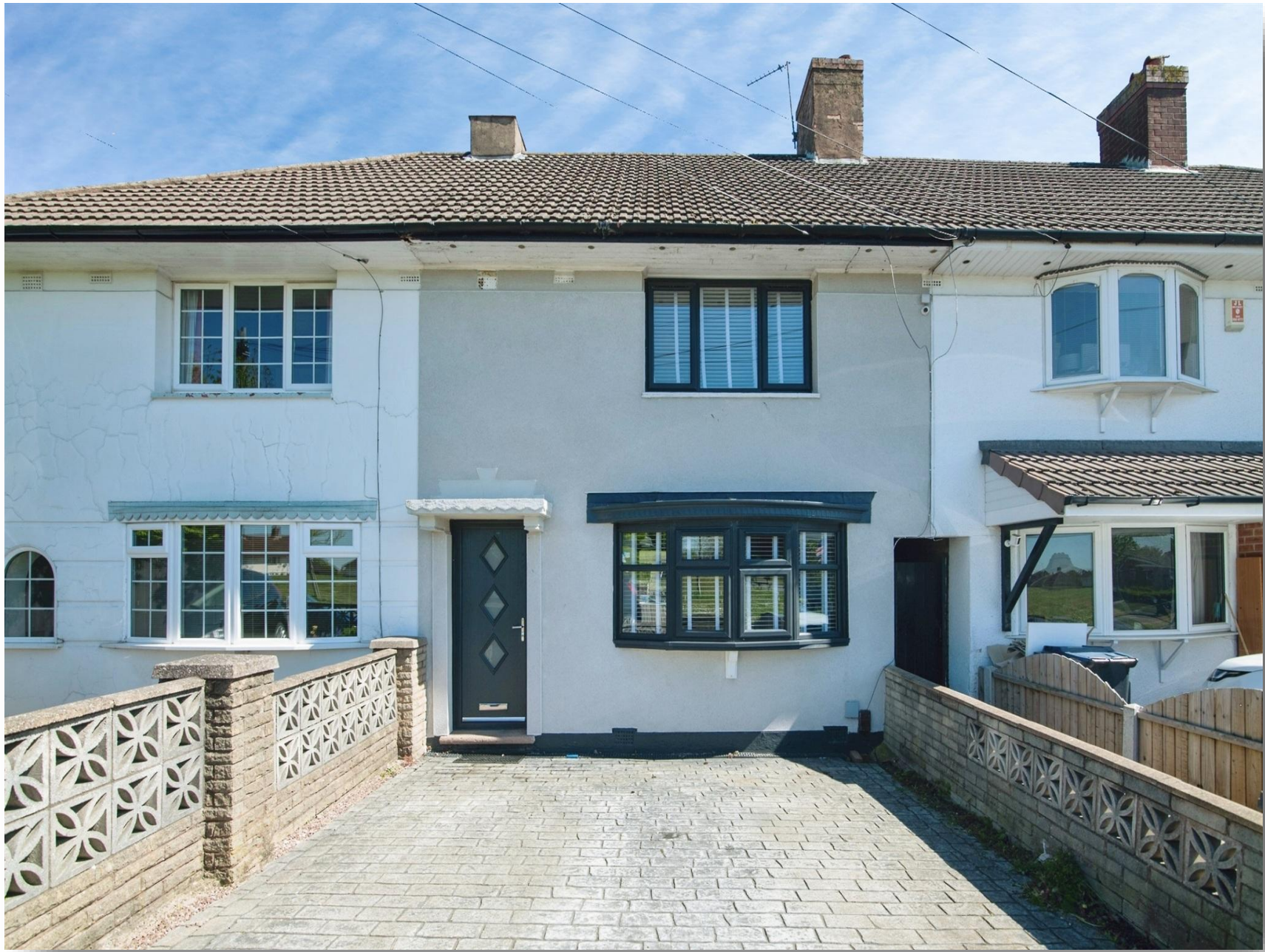
Bandywood Crescent, Birmingham B44 9NA