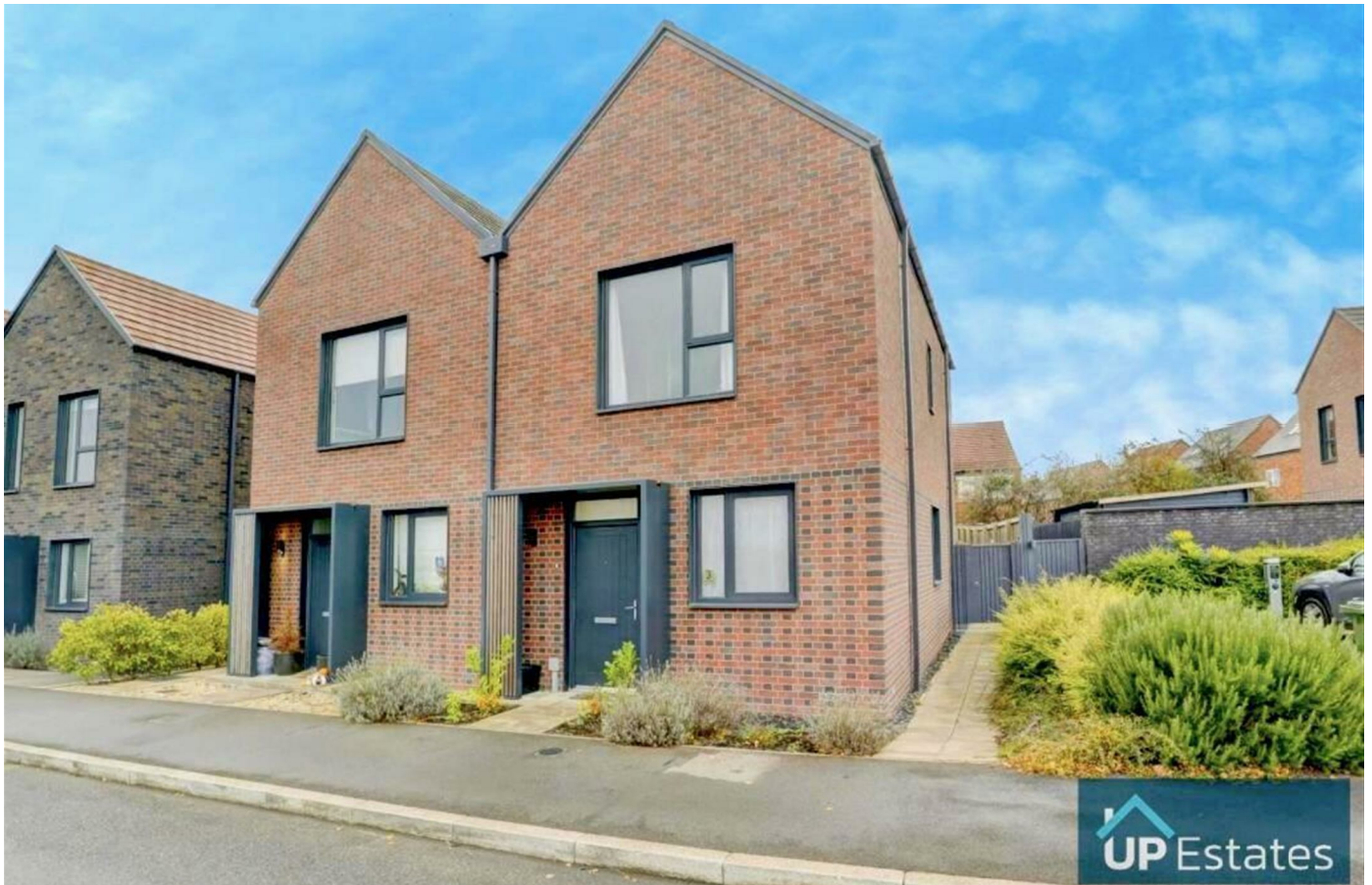
Park View, Houlton, Rugby