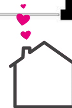
Illustration for identification purposes only, measurements are approximate, not to scale. Fourlabs.co © (ID1237233)

home sweet home estate agents your local property experts