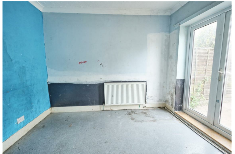
DINING ROOM 10'6" x 8'4" (3.22 x 2.56)