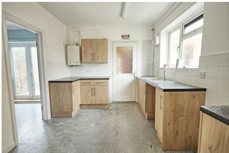
KITCHEN 11'9" x 9'10" (3.6 x 3)