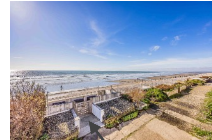
Sea view overlooking own enclosed private sun terrace