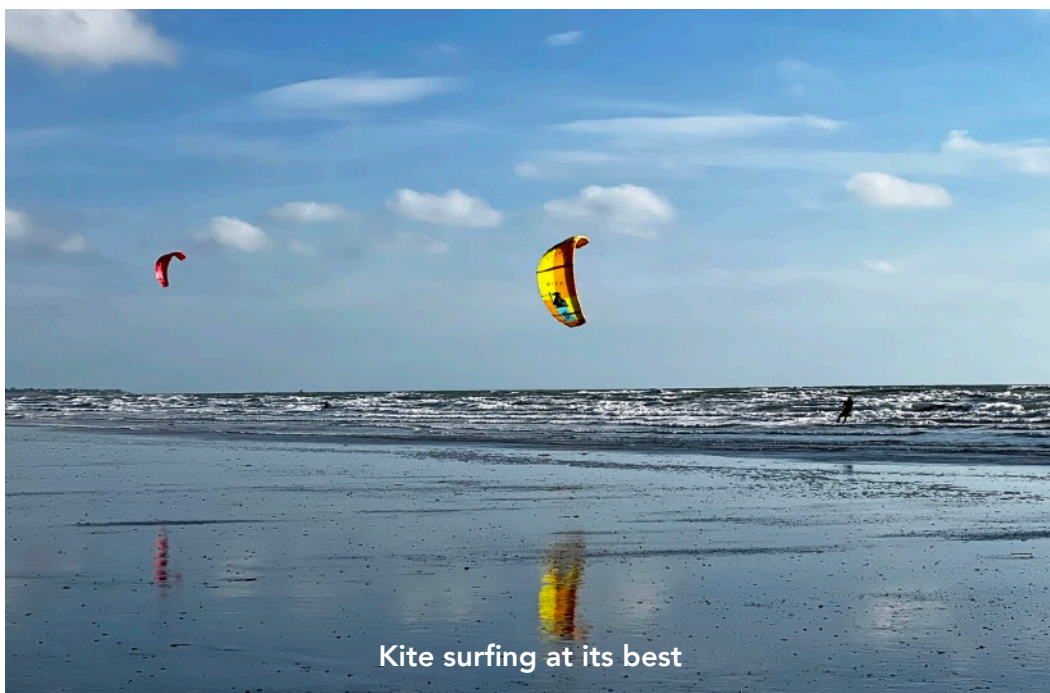
Kite surfing at its best