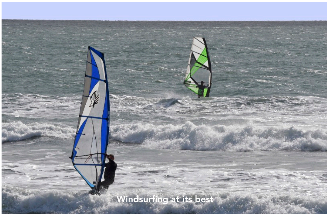
Windsurfing at its best