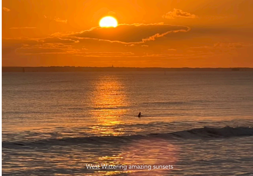
West Wittering amazing sunsets