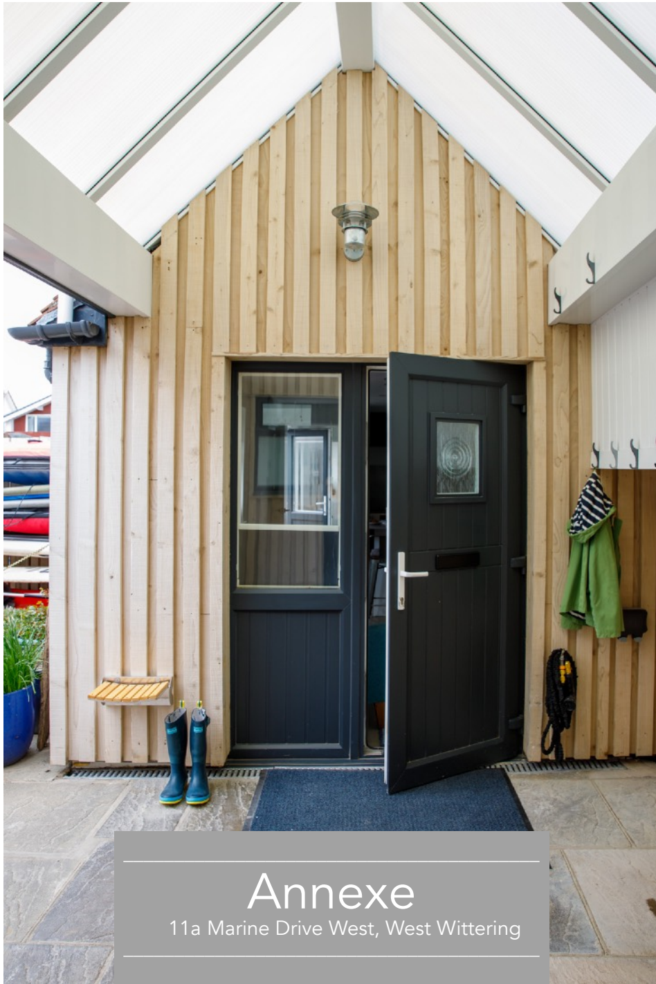
Annexe 11a Marine Drive West, West Wittering