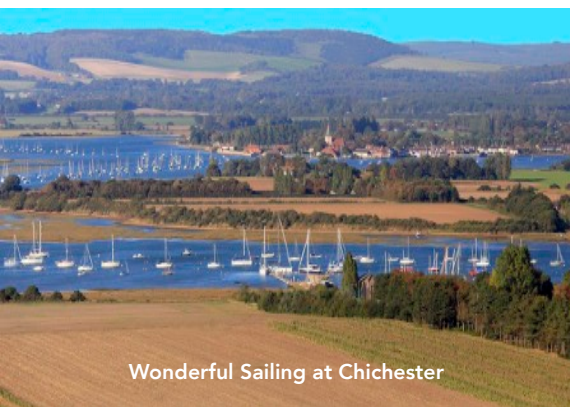
Wonderful Sailing at Chichester