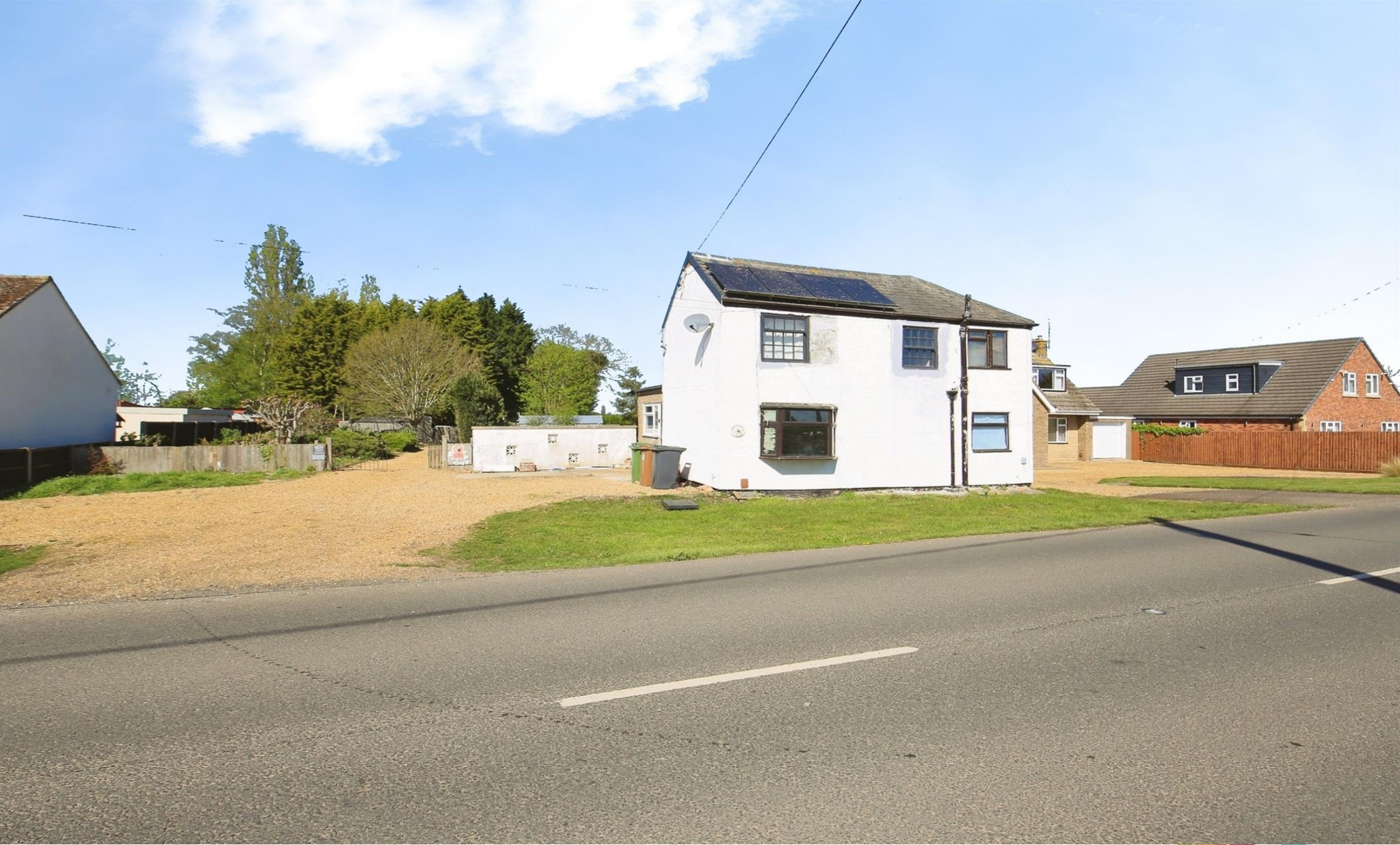
Morton House Guntons Road, Newborough Peterborough PE6 7RU