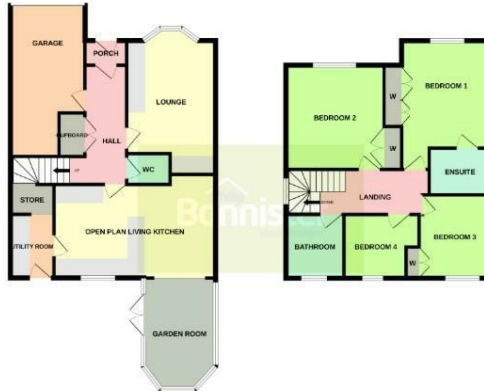
1ST FLOOR 821 sq.ft. (57.7 sq.m.) approx.

TOTAL FLOOR AREA: 1625 sq.ft. (152.4 sq.m.) approx.