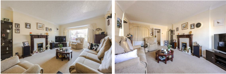
Lounge 20'0" x 11'10" (6.12 x 3.62)