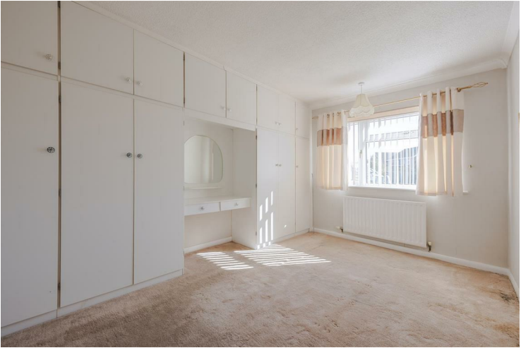
Bedroom one 13'4" x 9'11" (4.08 x 3.04)