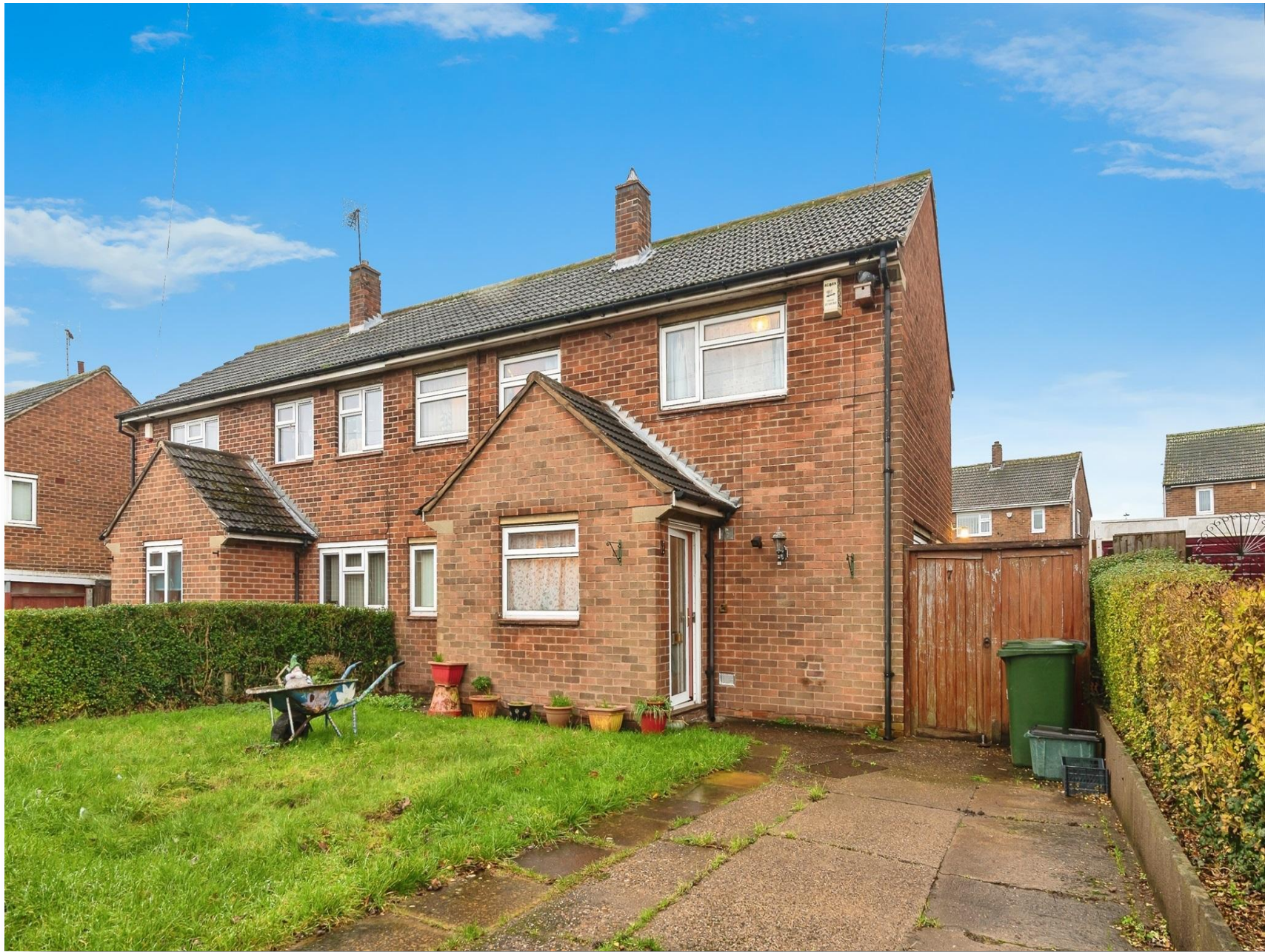
Glade Hill Road,Arnold Nottingham NG5 6FL