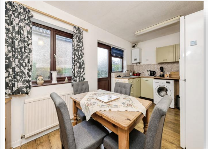
Louthe Way, Sawtry Huntingdon PE28 5TR