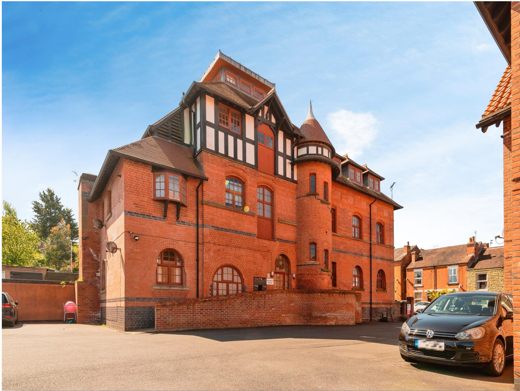
Sandpiper House Marhill Road, Carlton Nottingham NG4 3AJ