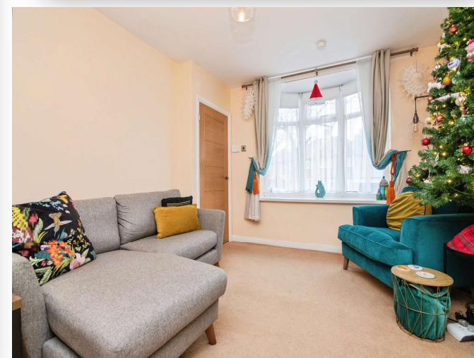
Rowdale Road, Great Barr Birmingham B42 2DQ