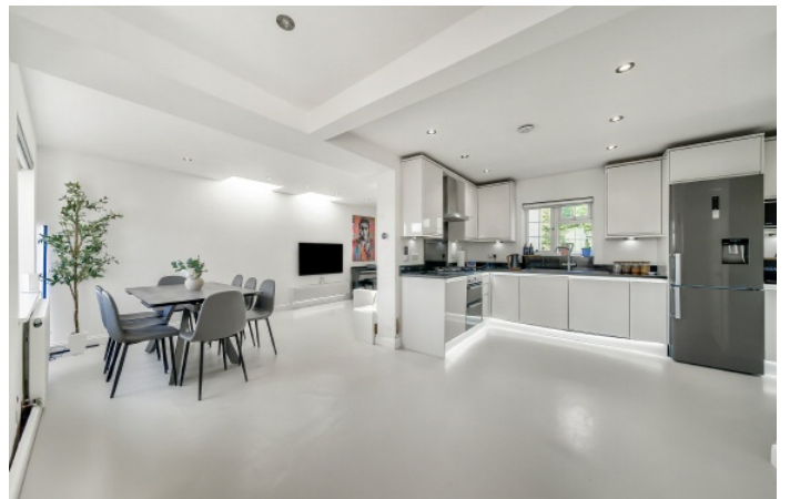
Berkeley Crescent, EN4