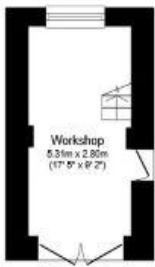
Outbuilding Ground Floor