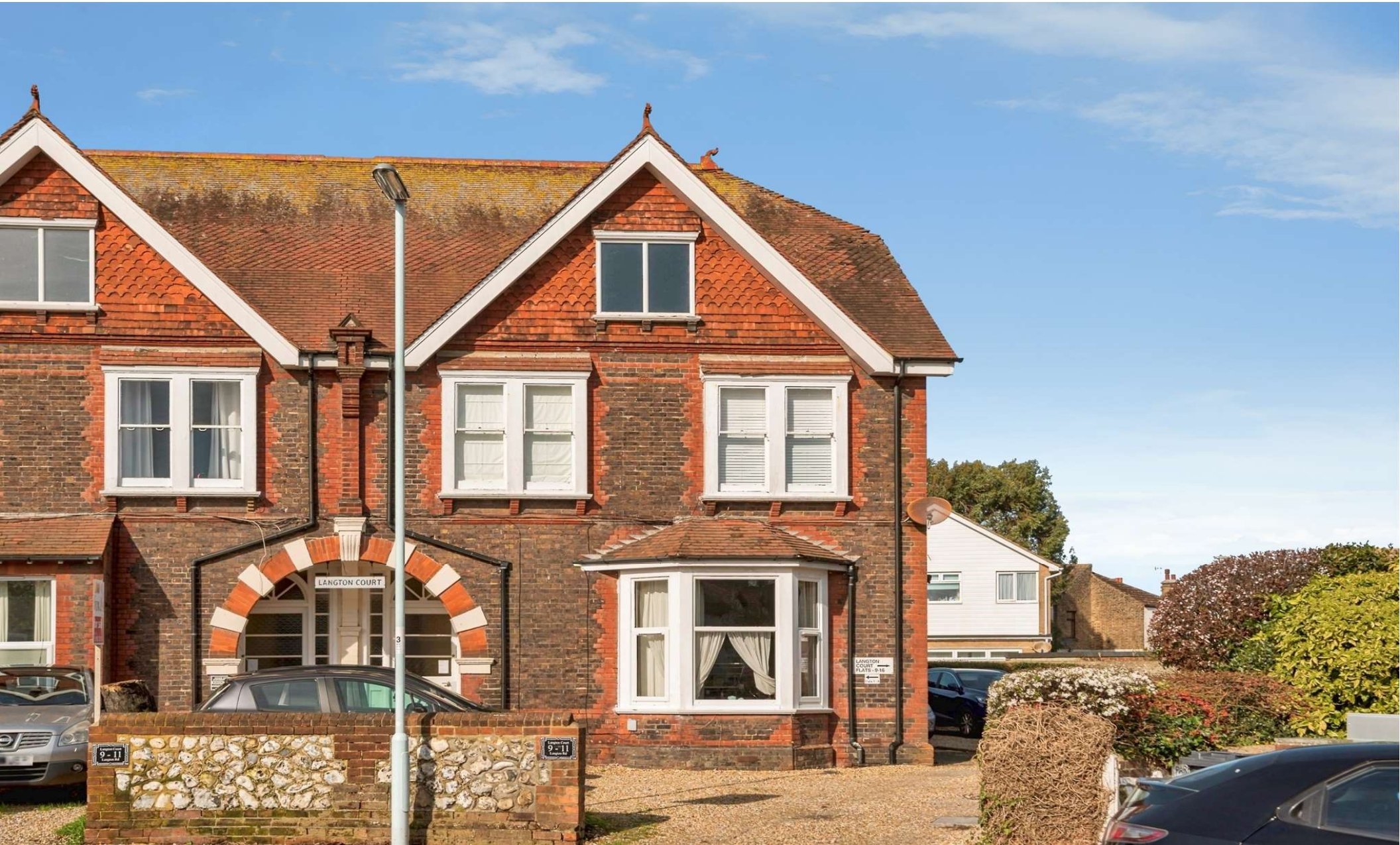
Langton Court Langton Road, Worthing BN14 7BZ