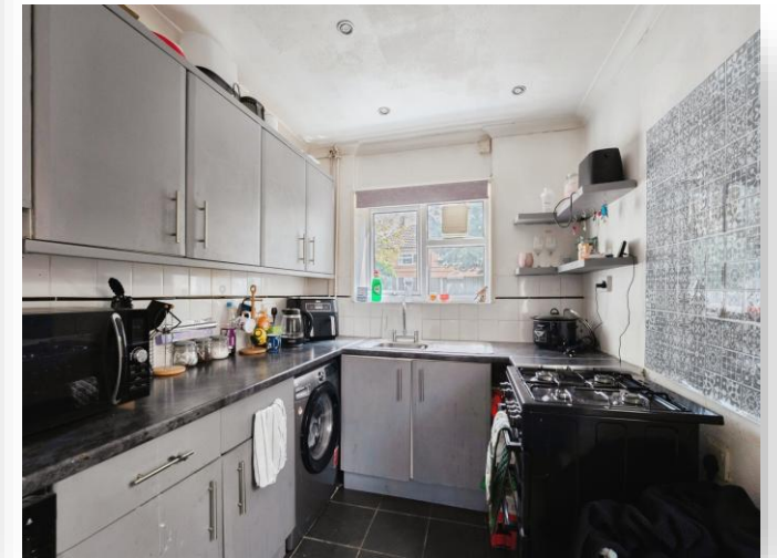
Parklands Gardens, Little Sutton Ellesmere Port CH66 3QP