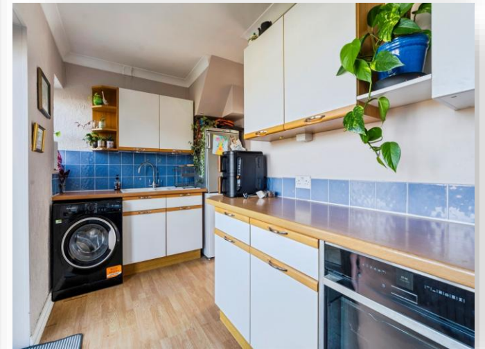
Orient Road, Lancing BN15 8JY