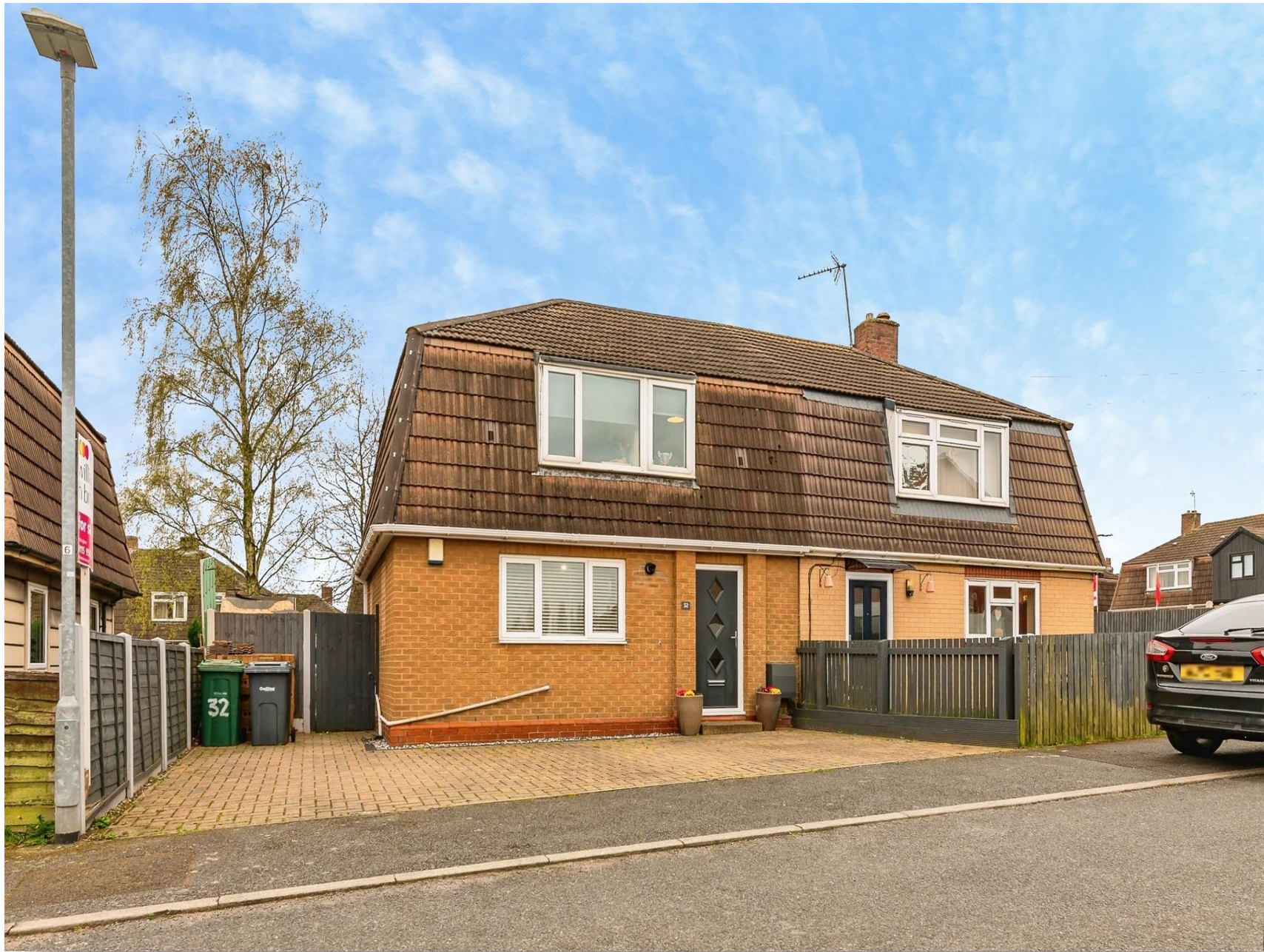
Pepper Road, Calverton Nottingham NG14 6LH