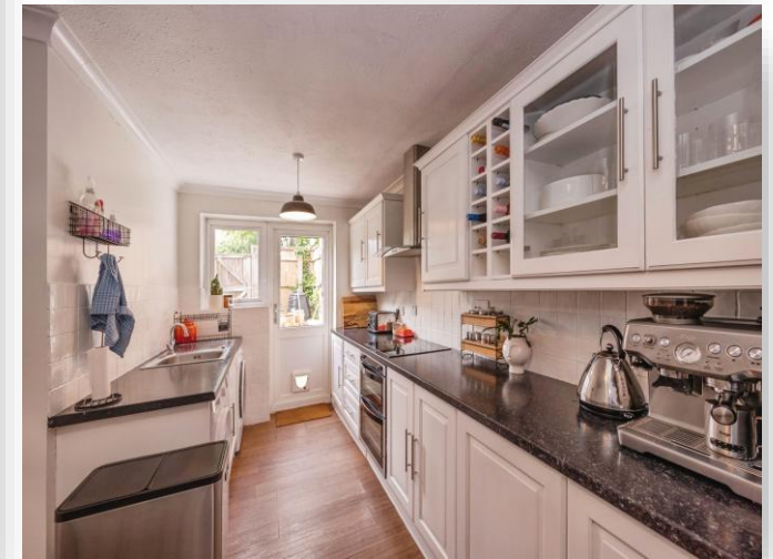
Mercury Place, Waterlooville PO7 8BA