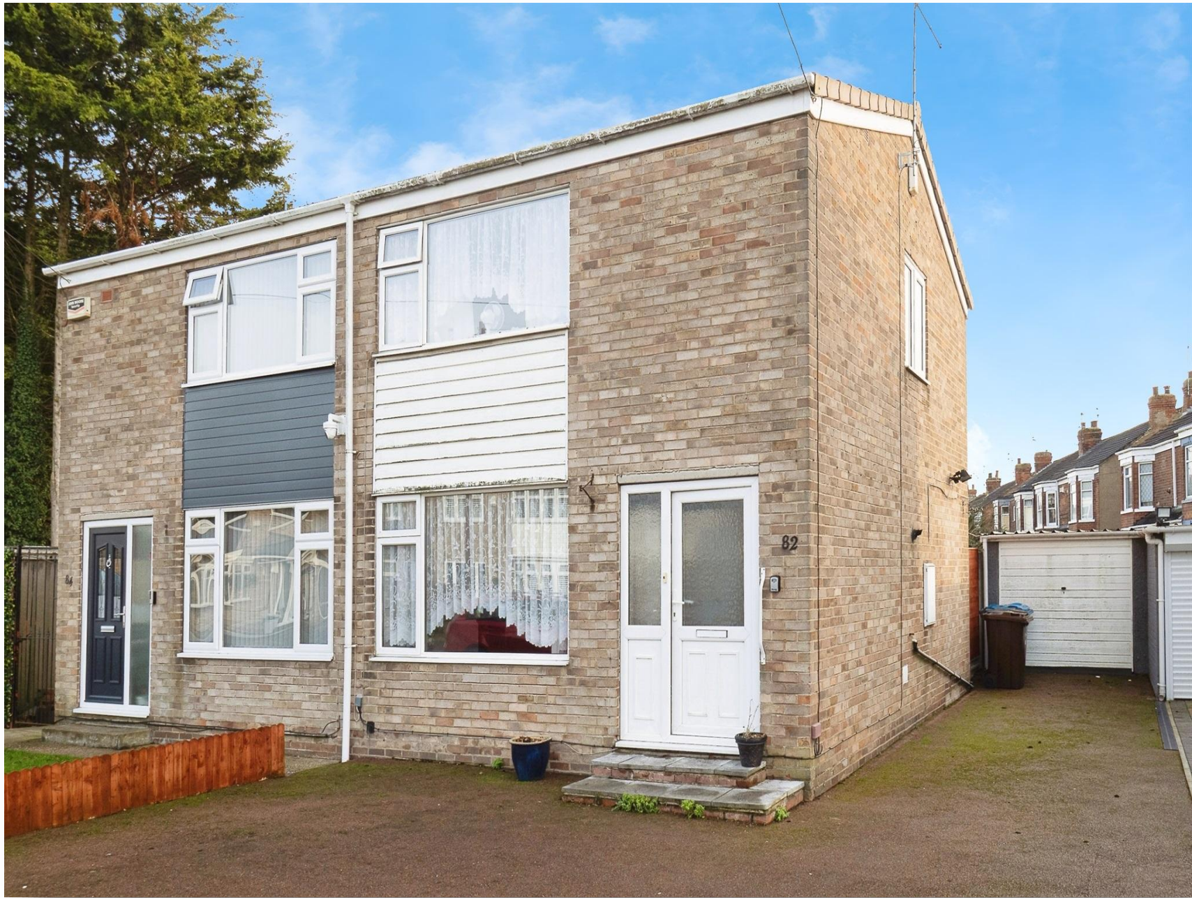
Dornoch Drive, Hull, HU8 8JL