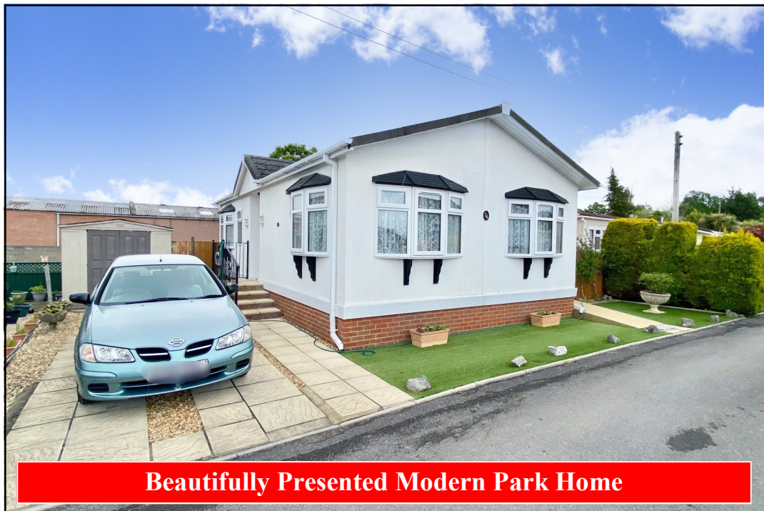
Beautifully Presented Modern Park Home

26 Holton Heath Park, Wareham Road, Holton Heath, Poole. BH16 6JS