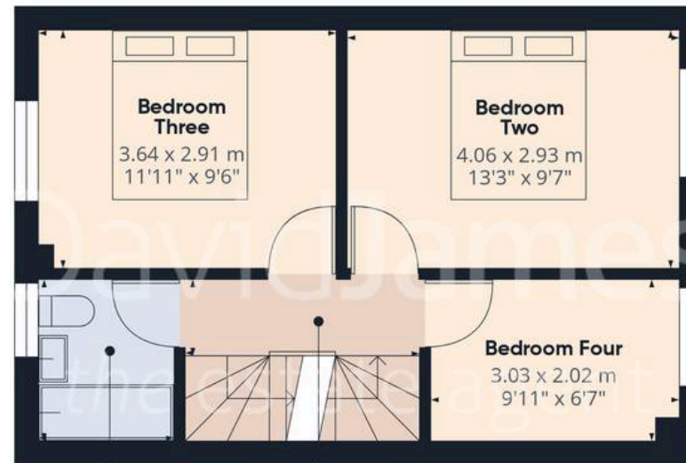
Bathroom 1.68 x 2.03 m 5'6" x 6'7"