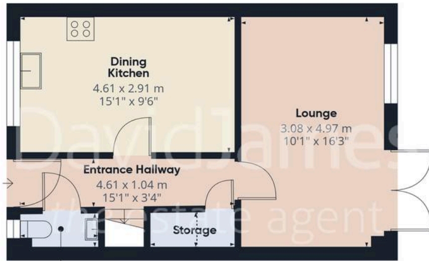
Ground Floor WC 1.74 x 0.93 m 5'8" x 3'0"