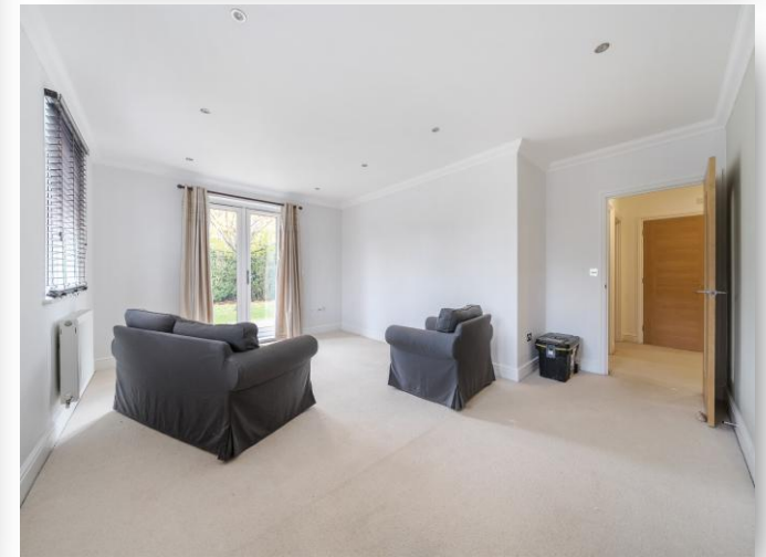
Flat 14 Fairway, Shoppenhangers Road, Maidenhead SL6 2PZ