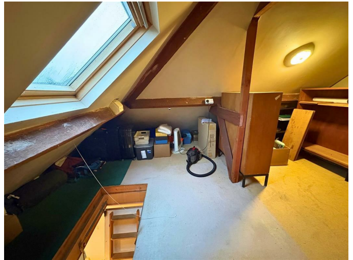
Loft Room 11'8" x 10'7" (approx.) (3.58 x 3.24 (approx.))

A boarded loft room with skimmed ceiling, skimmed walls, fitted carpet, wooden uPVC double glazed Velux window to the side, suitable as an office space / playroom etc.