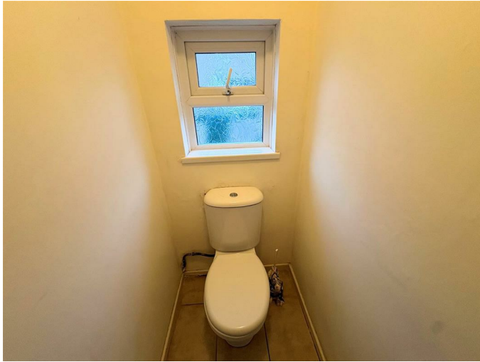
W.C. 4'7" x 2'11" (1.40 x 0.90)

Skimmed ceiling, skimmed walls, tiled flooring, low level W.C., uPVC double glazed window to the side.