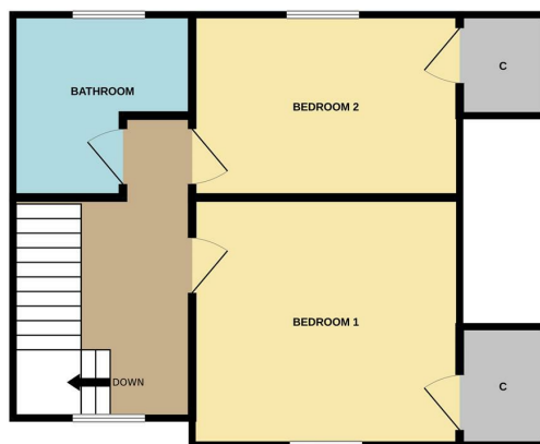
TOTAL FLOOR AREA: 808 sq.ft. (75.1 sq.m.) approx.

Whilst every attempt has been made to ensure the accuracy of the floorplan contained here, measurements of doors, windows, rooms and any other items are approximate and no responsibility is taken for any error, omission or mis-statement. This plan is for illustrative purposes only and should be used as such by any prospective purchaser. The services, systems and appliances shown have not been tested and no guarantee as to their operability or efficiency can be given. Made with Metropix ©2026