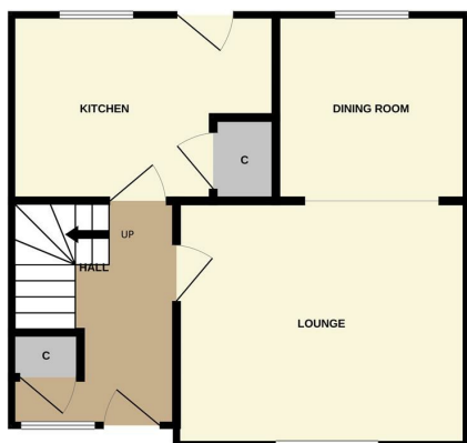
GROUND FLOOR 383 sq.ft. (35.6 sq.m.) approx.