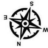
Crofton Park Av Approximate Gross Internal Floor Area 1176 sq. ft / 109.25 sq. m